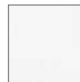
White CRF CRF-1