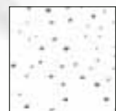
White Perforated CRF CRFP-1