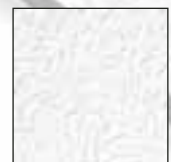
White Plume PLM-1