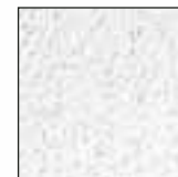
White Nubby NBY-1