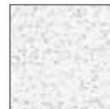
White Overtone® OVT-1