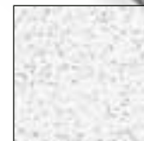
White Overtone® OVT-1