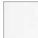
White CRF – CRF-1