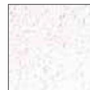
White Nubby – NBY-1