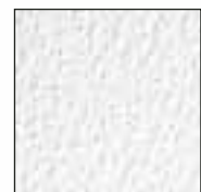
White Elite – ELT-1