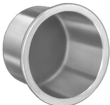
ANCHORING METHOD FOR WALLS UP TO 4-3/4" THICK